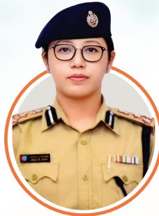
Smt. Aotula T. Imchen, IPS Commissioner of Police, Dimapur